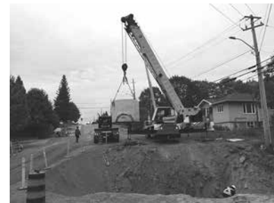
Emily Street reconstruction

The contractor has started on the southern section, next to Seguin Township. The large culvert at Fowler Drive is currently being replaced. It is a very old and deep culvert, and the storm water has been pumped around the site to expedite the replacement. Traffic control measures are in effect, and everyone's patience is appreciated.