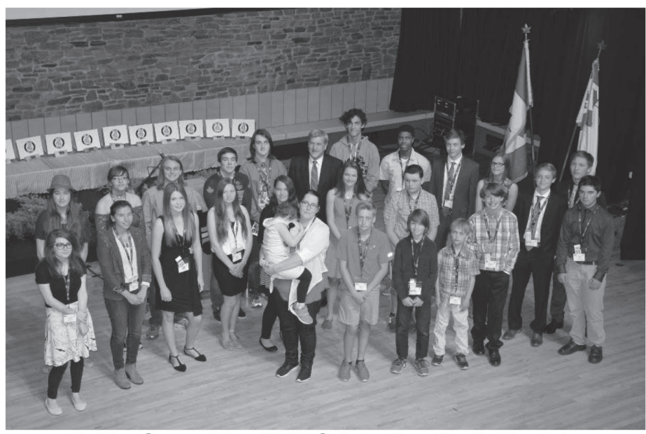
Bobby Orr and the 2017 Celebrating Youth Finalists