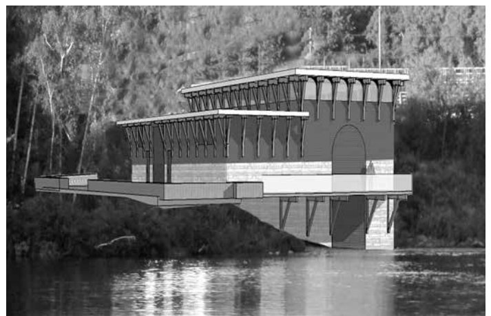
New Power Station

Maple Reinders is the General Contractor for the project. It is projected that $4 million will be spent locally on labour and materials. Craig Sparks is the contact and can be reached at CraigS@Maple.ca if you have an inquiry about this construction project.